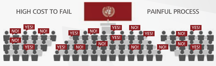
CSP internal complex processes hindering the time to market

For CSPs, a complex and painful process has to be gone through for a single carrier-grade service: requirement definition, vendor selection, product development, service implementation, proof of concept, acceptance testing, and trials. Normally it takes months to go through all these and get everyone from different business units to agree on a single service. These painful processes as well as slioed legacy systems directly enlarge the cost to fail for a CSP service which inhibits service innovation within the organization.