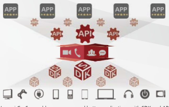
Huawei CaaS – enable more users and better applications with SDK and API